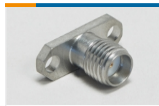
RF Connector Launchers(8)