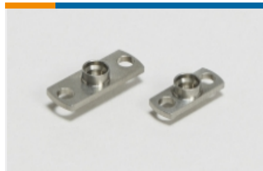
RF Connector Shrouds(3)