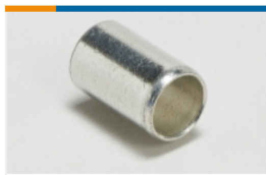
Rack &amp; Panel Ferrules &amp; Inserts(1)