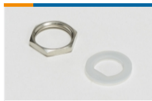
RF Connector Hardware(2)